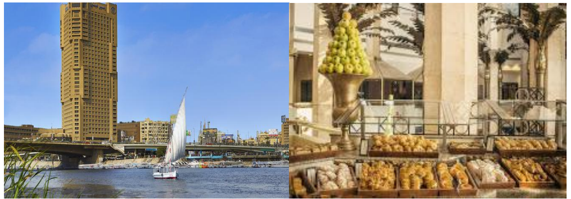
Website of Sino-Egyptian Congress: